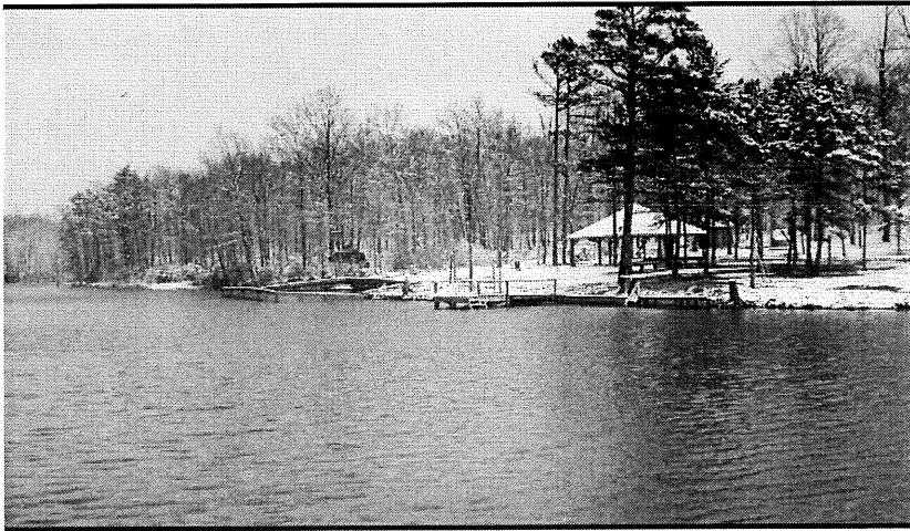
Image of Wenonah Lake October 1945